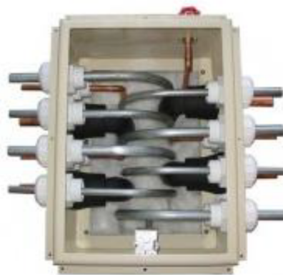
Top view of the "Medium" Pipe Chase Housing with the lid removed with 16 Sigrist Exit Seals® installed. (Contractor installed hose bibb and power)