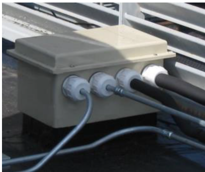
"Small" Pipe Chase Housing With 4 Sigrist Exit Seals® installed

Locate the machine stamped "Starter Dimples" on the front or rear face of the Pipe Chase Housing. Then, using a metal cutting hole saw (or punch), drill a 2 1/4" Diameter hole at the desired location. Clean burrs off the inside and outside of the fresh cut. Remove the Exit Seal backing nut then insert the Sigrist Exit Seal® from the outside of the Housing unit. Re-thread the Exit Seal backing nut back onto the body of the Exit Seal from the inside of the housing—use a strong "hand tight". Do not over tighten with a wrench.