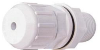
Sigris Exit Seal®