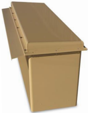
Sigris Data Center Housing

ALTA PRODUCTS LLC Innovation That Works.™