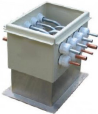
Photo above shows the size Medium Pipe Chase Housing atop a 14” tall curb with 16 Sigrist Exit Seals® installed.

ALTA PRODUCTS LLC Innovation That Works.™